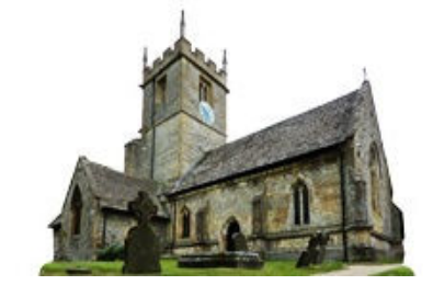
Hampton – Fairfield – Thistledown Eastwick Park – Charity Crescent